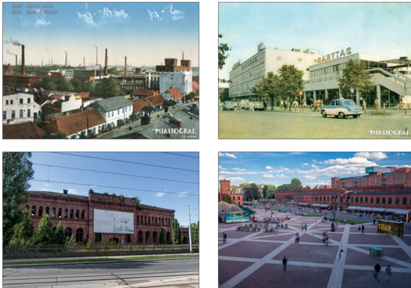
First row, left: The industrial cityscape of Łódź in its period of big-city growth (1910); – First row, right: The part of Łódź city-centre transformed in the communist era. Here, the Modernist architecture of a multifunctional office, gastronomic and commercial complex (1968); – Second row, left: The devastated landscape of formerly industrial land reflecting the collapse of the textile industry post-1990. Here, the former Uniontex “Defenders of Peace” Cotton Industry Mills (the merged enterprises once in the hands of K. Scheibler and L. Grohmann); – Second row, right: The revitalised post-industrial complex of what were once the Cotton Mills owned by Izrael K. Poznański. Here, the market square at the heart of the Manufaktura commercial and entertainment complex.

After the Second World War, the communist era brought new industrial districts and large housing estates within the city that resembled buildings from the late 19 th century in the one sense that they reflected the ideological primacy of the goal of industrial output, though obviously now from the point of view of communist, rather than capitalist, ideolo-